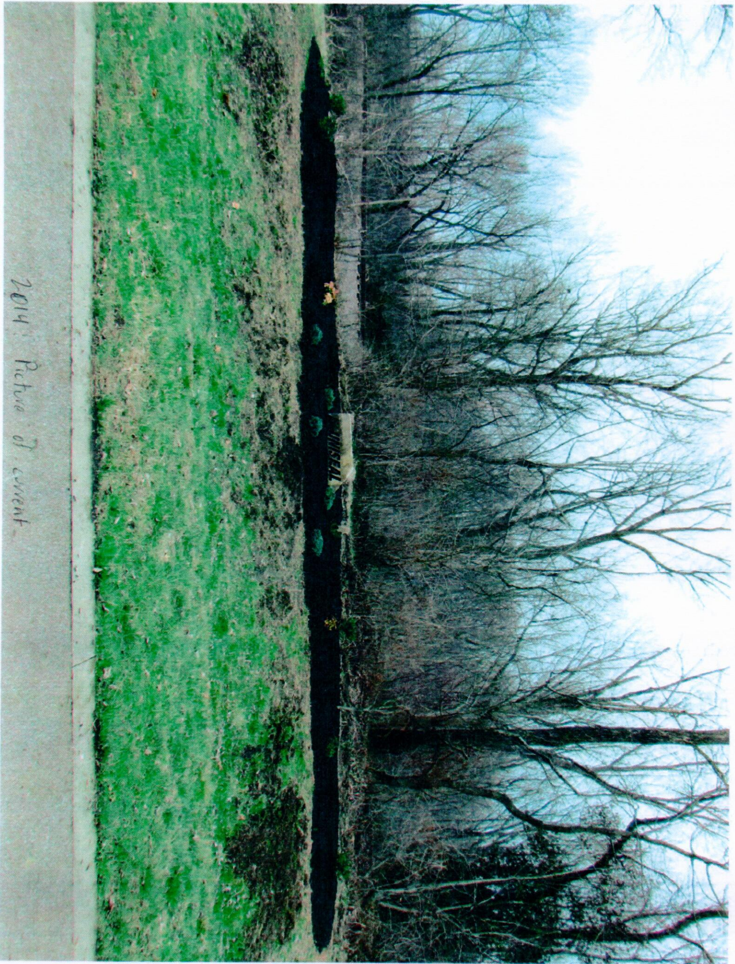
2014: Picture of current